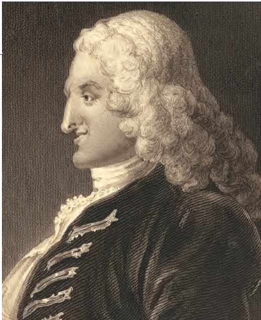
Henry Fielding by Samuel Freeman.