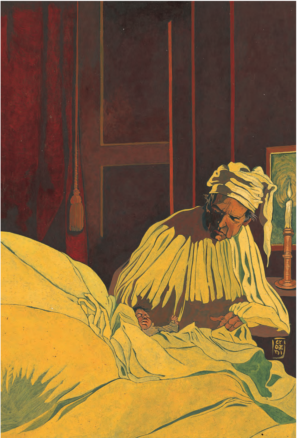
Vicens Vives - Tom Jones (Blackcat. Reading & Training) - ISBN: 9788431672621