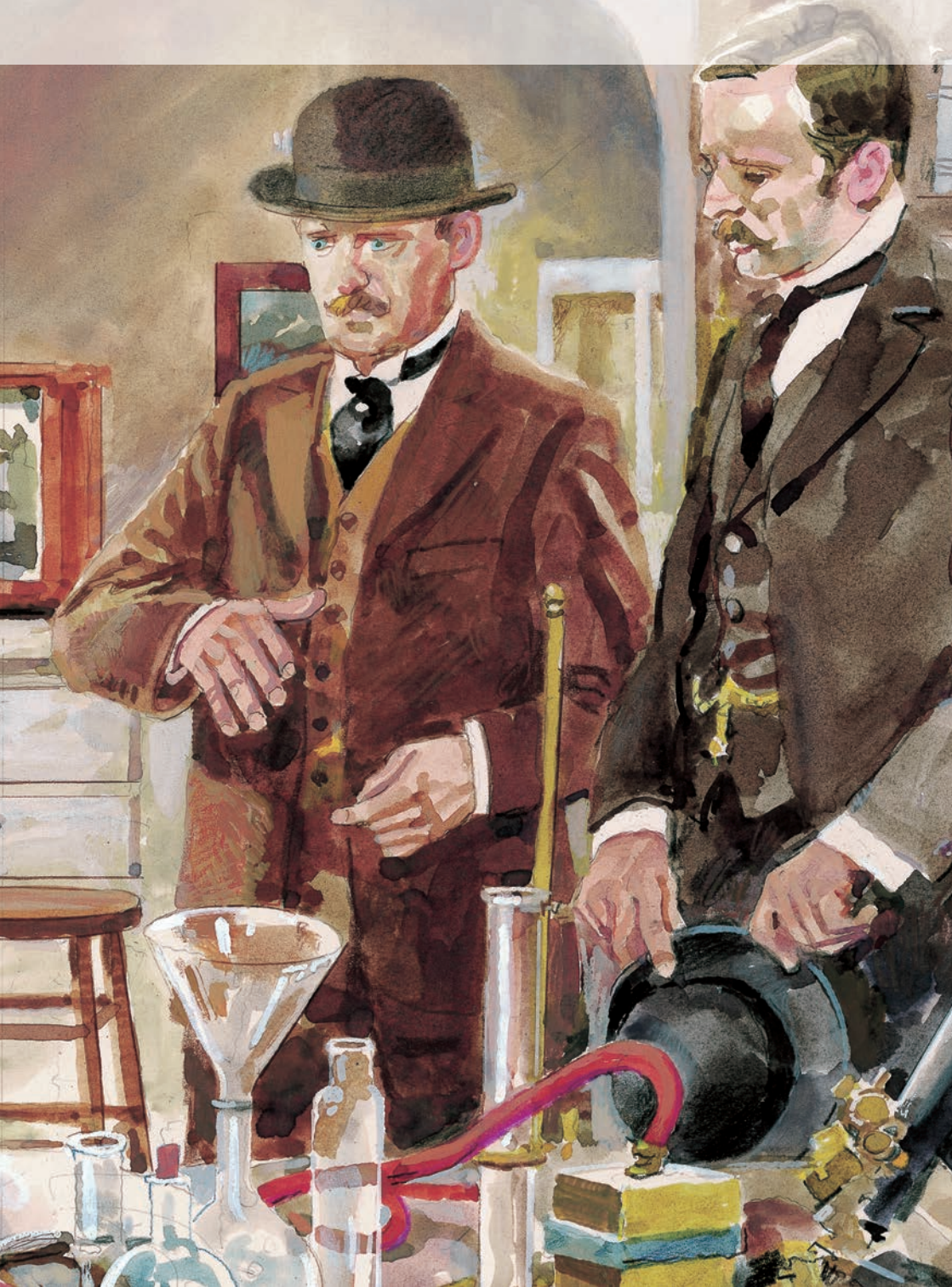
Vicens Vives - A Study in Scarlet (Blackcat. Reading & Training) - ISBN: 9788853002952