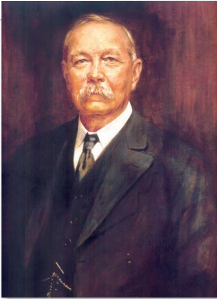
Sir Arthur Conan Doyle (1927) by Henry L. Gates.