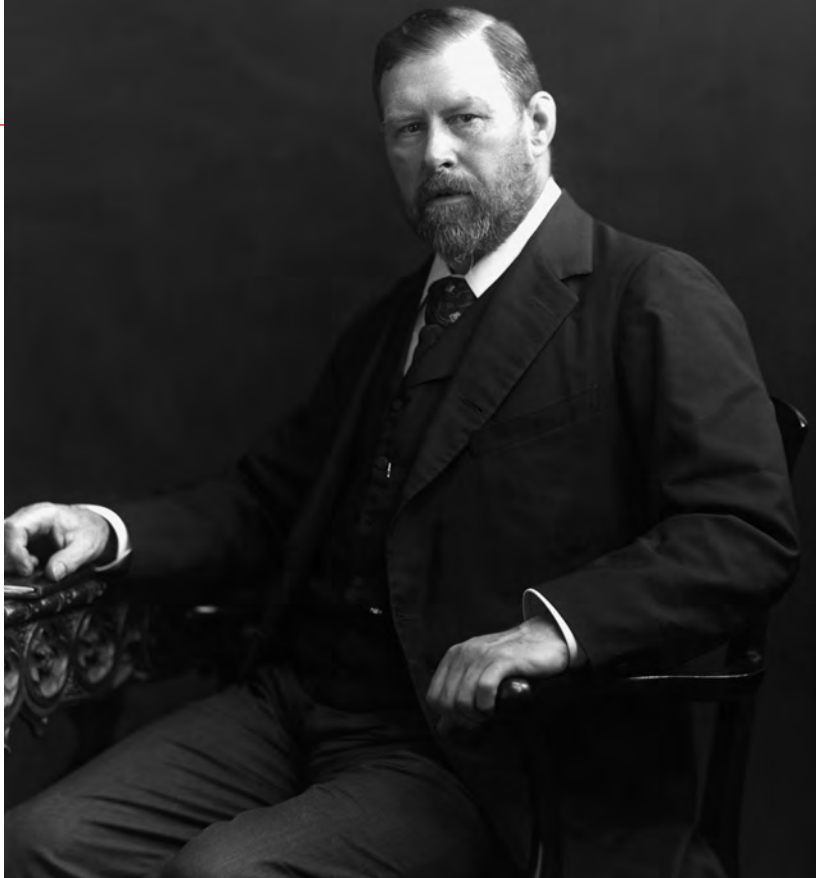
Bram Stoker (about 1880).