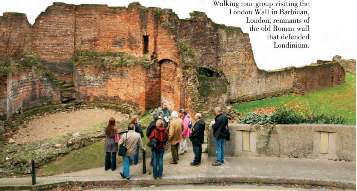
Walking tour group visiting the London Wall in Barbican, London; remnants of the old Roman wall that defended Londinium.

Six important Roman roads started in or passed through Londinium; one of the most famous was Watling Street. It was an old road that went from Wales to Dover and it was improved by the Romans. People still use it today.