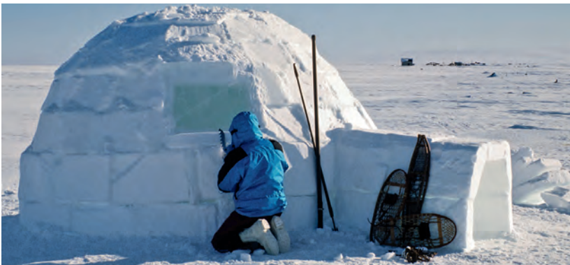
A traditional Inuit igloo.

4. Hunter : this person kills animals for food.