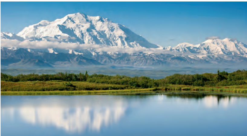
A beautiful Alaskan landscape.

The famous American writer Jack London (1876-1916) went to the Klondike to look for gold, but he didn't find any. He left the Klondike with no gold, but with many ideas for his best stories like The Call of the Wild (1903) and White Fang (1906).